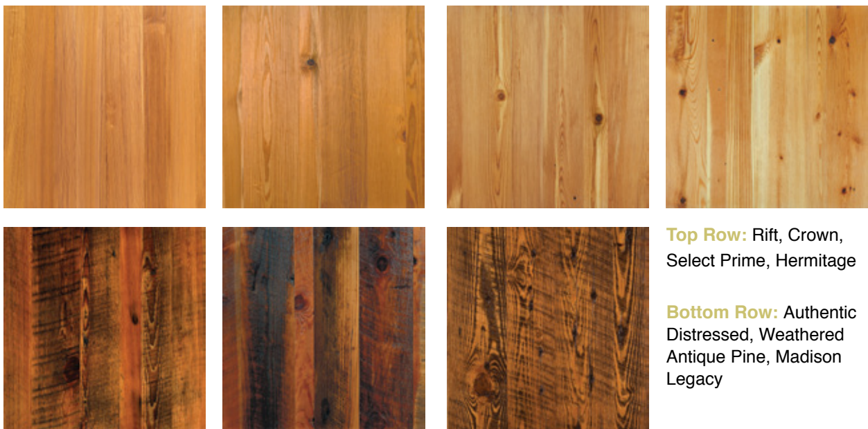
Top Row: Rift, Crown, Select Prime, Hermitage

Fortunately, this beautiful wood is still available through reclamation. During the Industrial Revolution, mills and factories were built along the East Coast using heart pine as the primary framing material. Every year, more of these 19th century facilities become slated for demolition. Now, this rich amber wood can share its beauty with future generations.