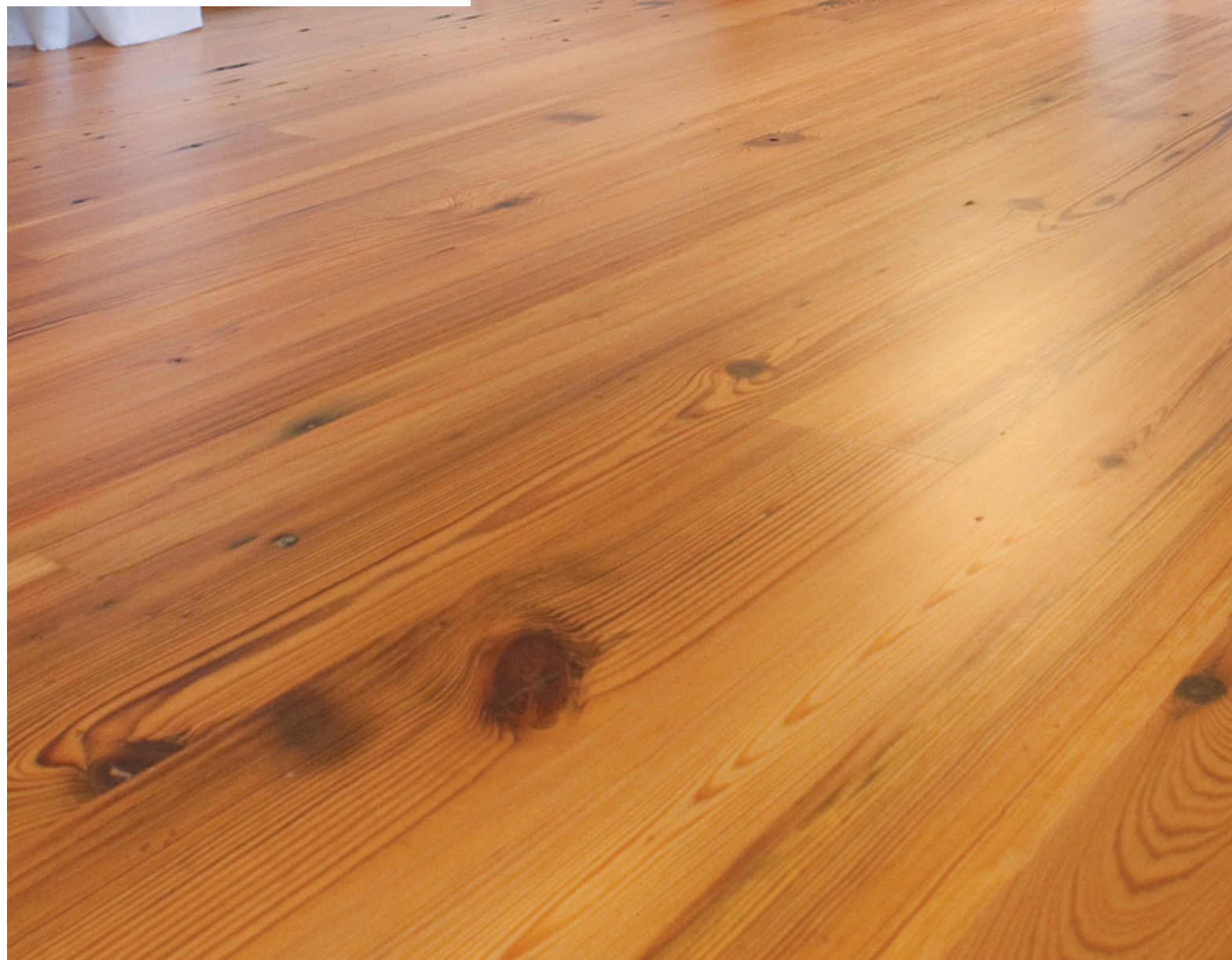
Hermitage Heart Pine