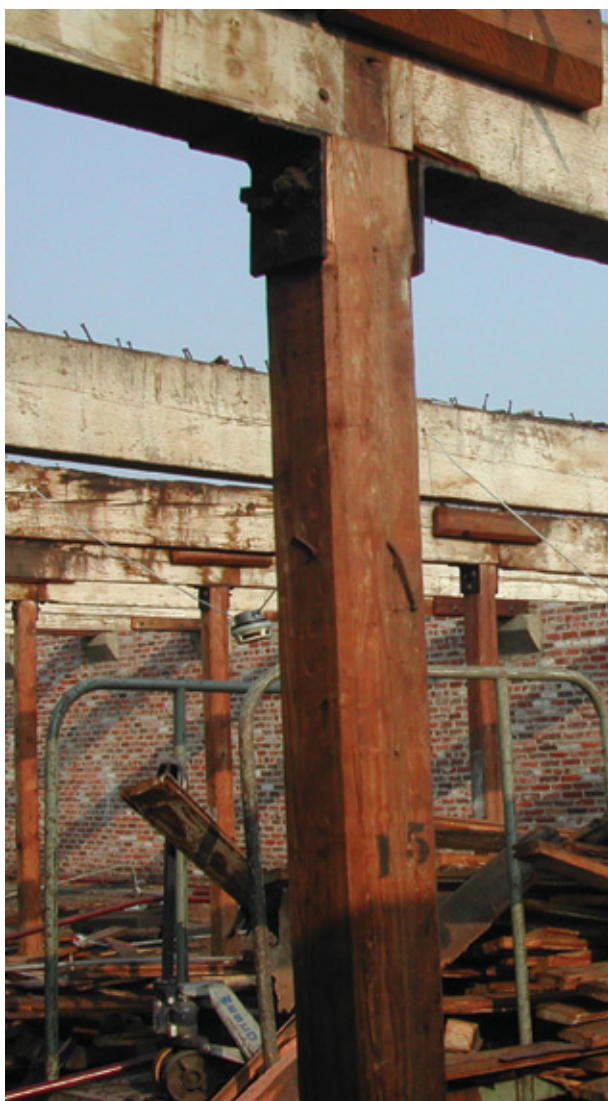
A "Reclaimed Forest" in Danville, Virginia