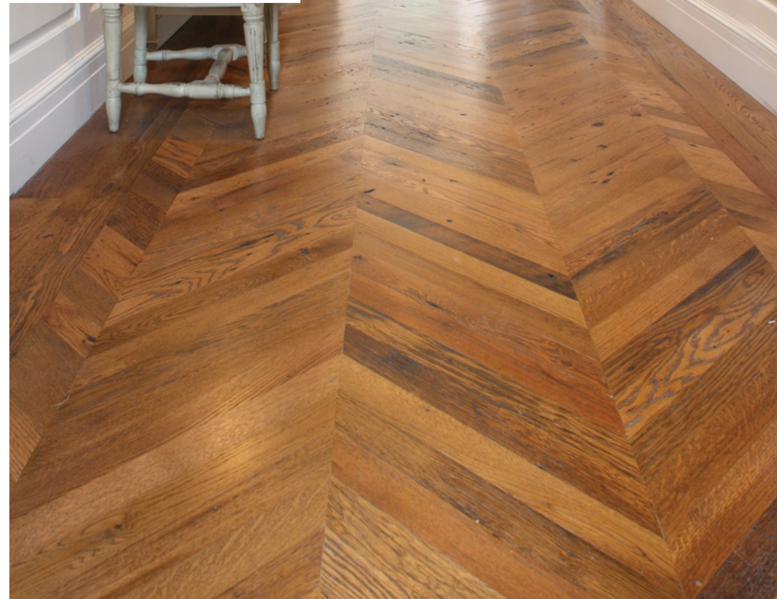
Antique American Oak