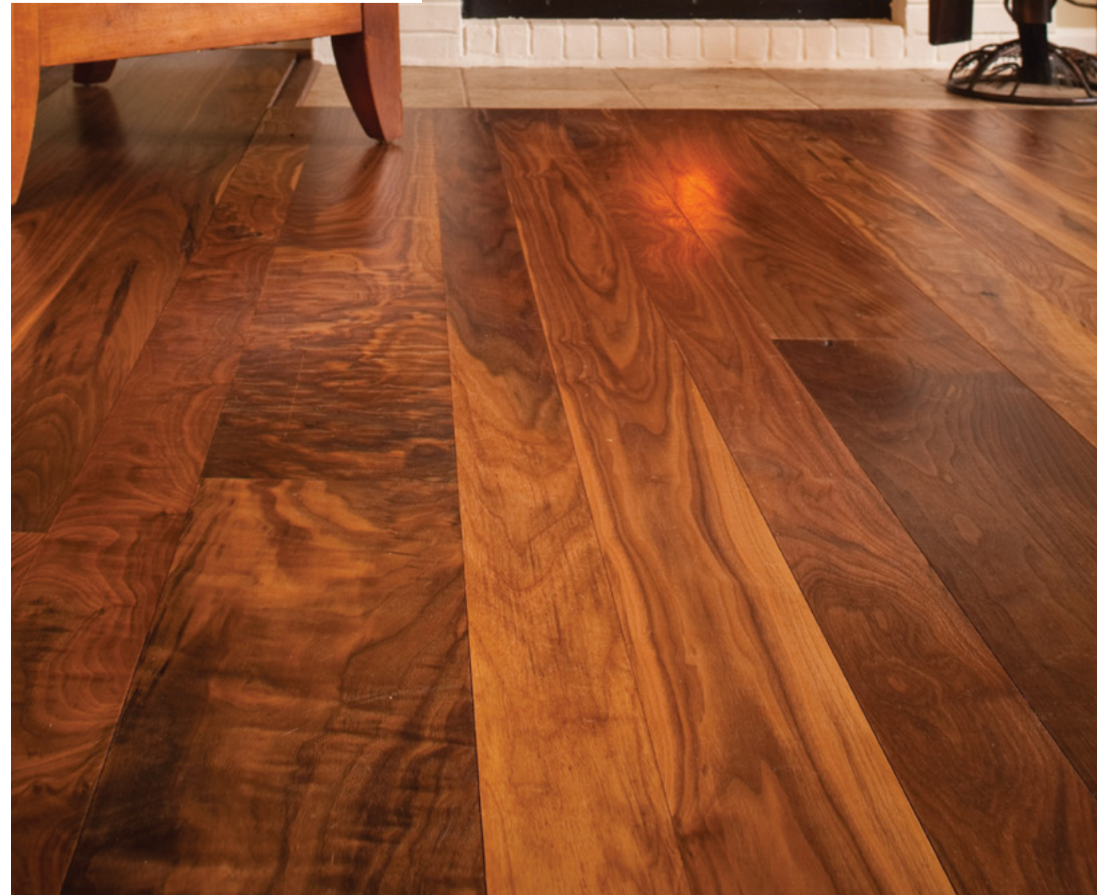
Harvest Select Walnut