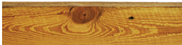
Rough Sawn Beams

Similar in design value to the ornamental and structural beams, Mountain Lumber's reclaimed mantels are scaled down to fit most applications. Mantels can be ordered in Historic Heart Pine® or other woods including Antique American Oak and Antique American Chestnut. Please call for pricing.