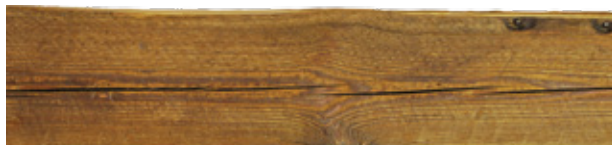
Wire Brushed Beams