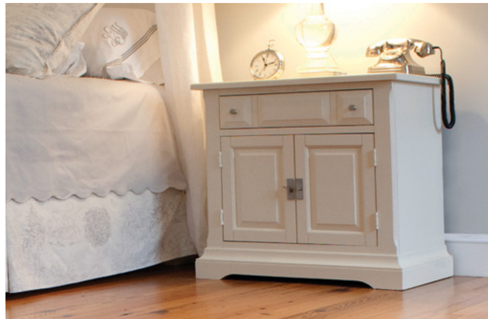
Prefinished Distressed Heart Pine