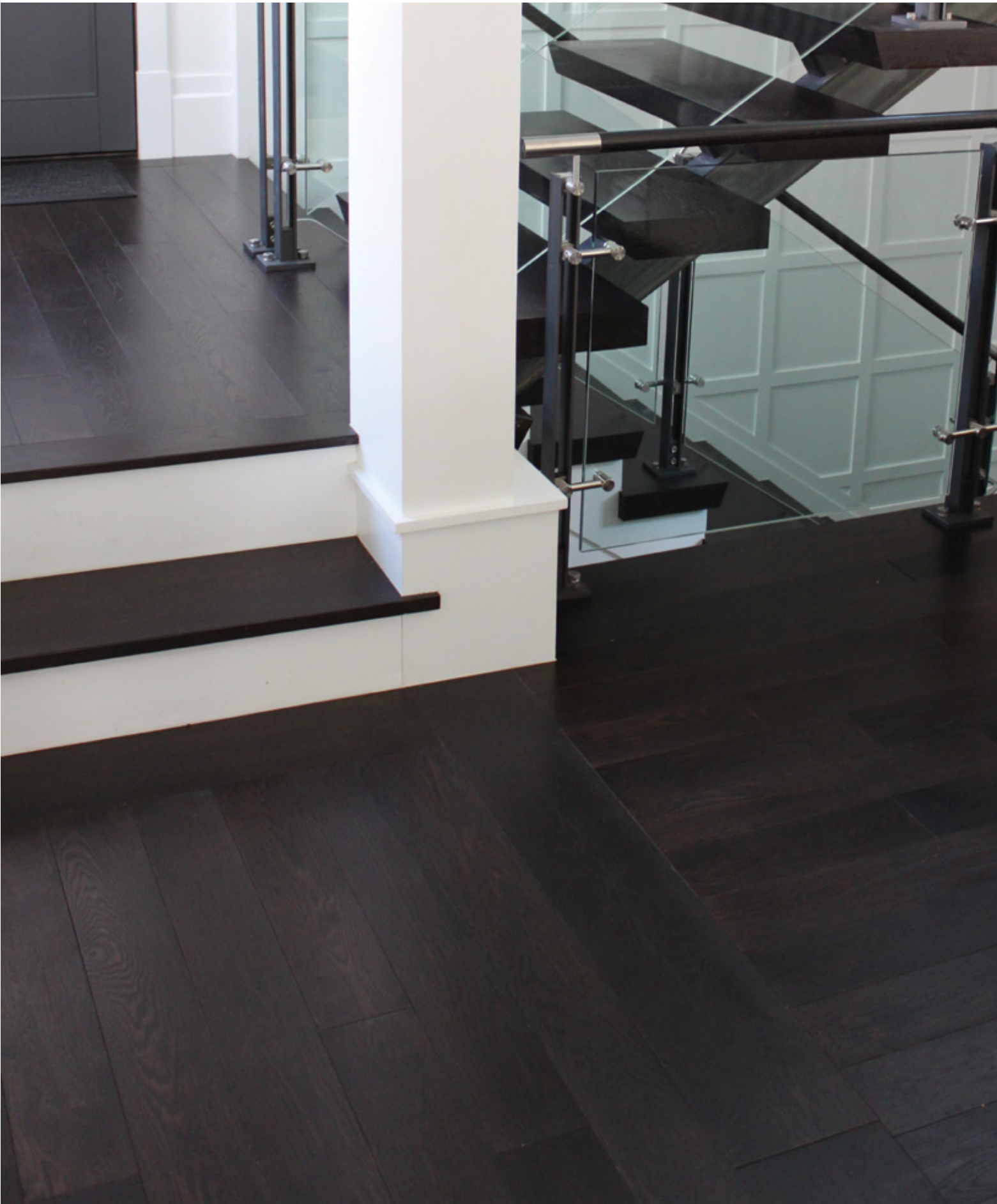
Harvest Prefinished White Oak