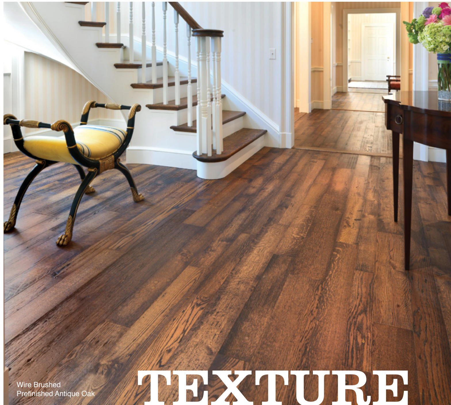
Wire Brushed Prefinished Antique Oak