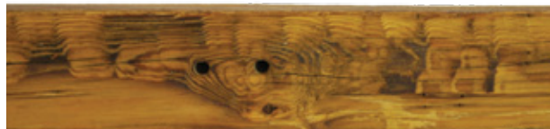
Hand Adzed Beams