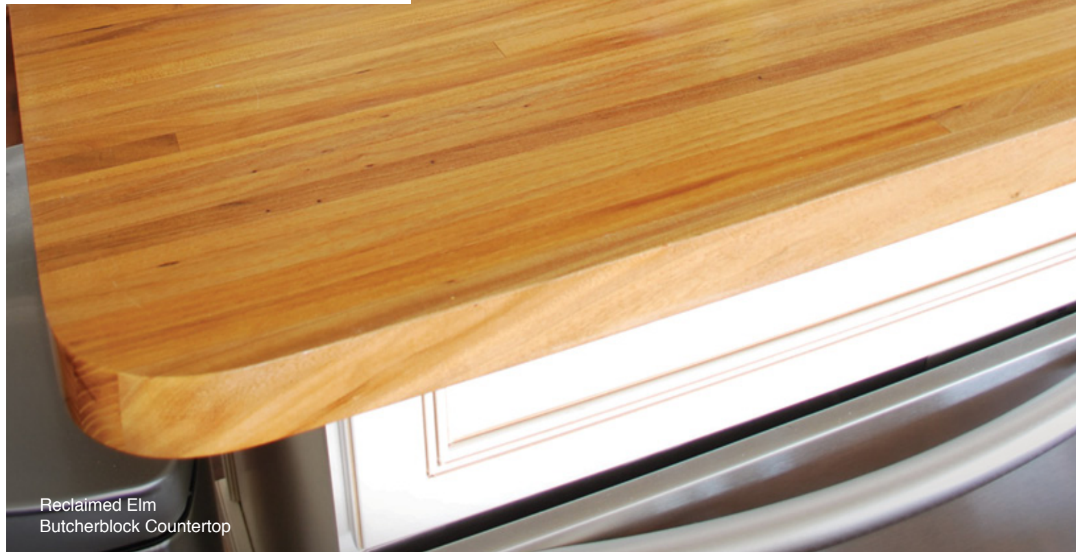
Reclaimed Elm Butcherblock Countertop