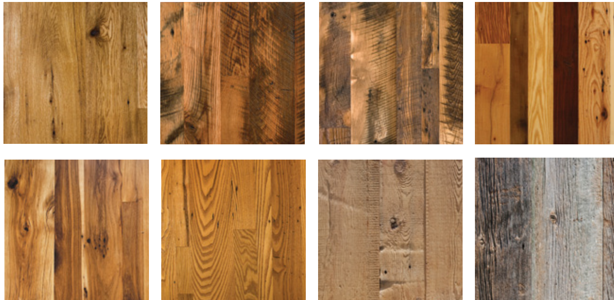
Top Row: Antique Oak, Granary Oak, Homestead Distressed, Homestead Smooth Bottom Row: Antique Hickory, Antique Chestnut, Brown and Gray Barn Board

As farming methods modernize, the barns of the past increasingly suffer from lack of use and repair. Eventually, they surrender to the elements they were built to keep at bay. Rather than abandoning the wood, Mountain Lumber reclaims it and restores it to its former brilliance.