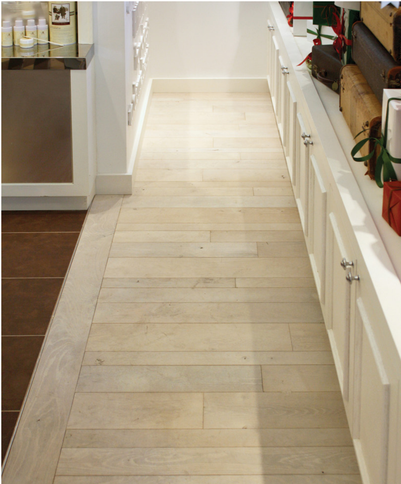
Harvest Prefinished White Oak