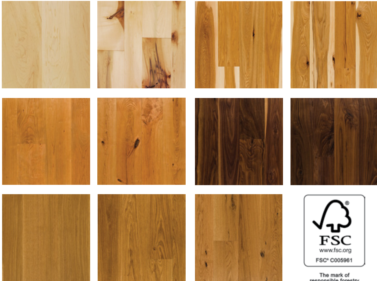
Top Row: Select Maple, Character Maple, Select Hickory, Character Hickory

Council provides the strictest governance on how forests should be managed in order to protect them for future generations. Our FSC certification allows us to track each certified board to a responsibly managed forest; thus ensuring your purchase promotes responsible forestry.