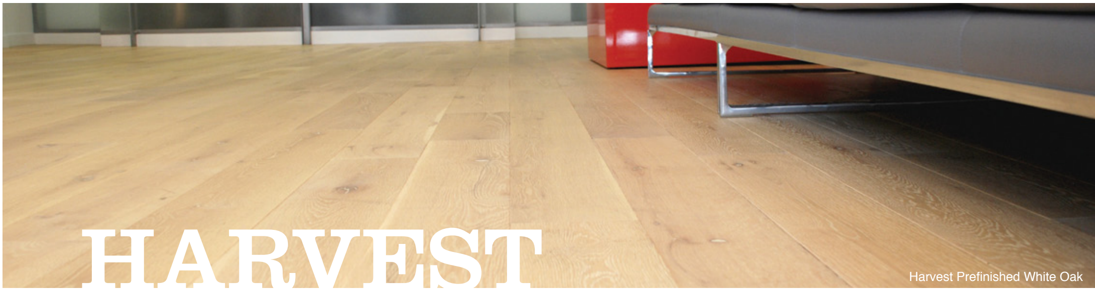
Harvest Prefinished White Oak